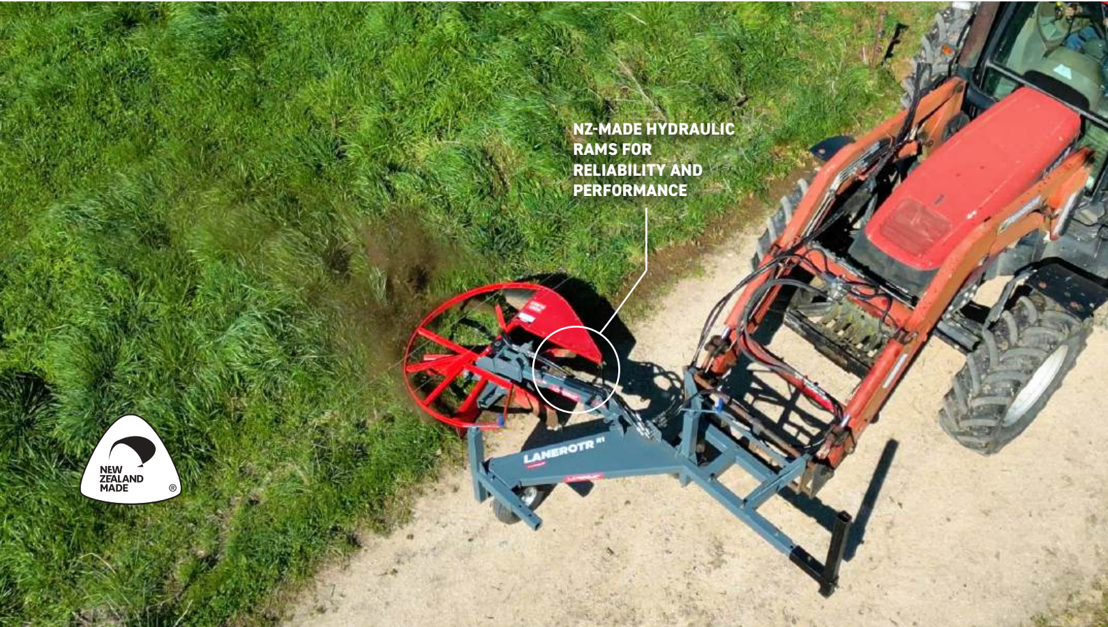
NZ-MADE HYDRAULIC RAMS FOR RELIABILITY AND PERFORMANCE