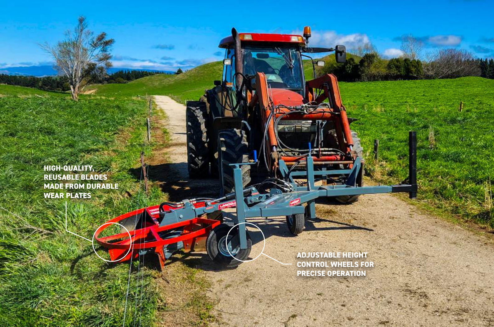
HIGH-QUALITY, REUSABLE BLADES MADE FROM DURABLE WEAR PLATES